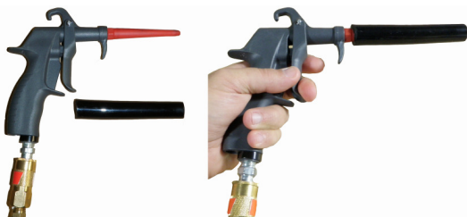
H3 RAFT HOSE ATTACHMENT & INFLATION VALVE